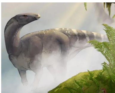
An artist's impression